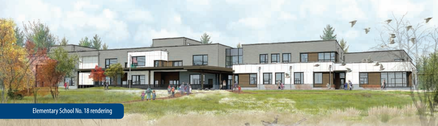
Elementary School No. 18 rendering